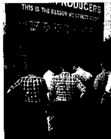
"Cow's & Cows" Summer Camp, 1965.

Next year's conclave host will be the University of Georgia.