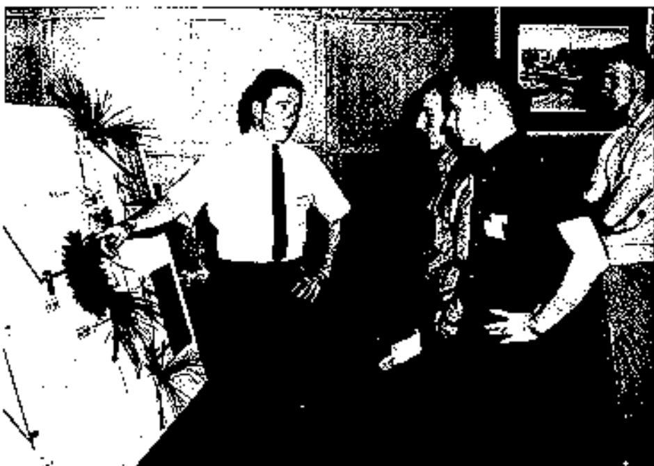
First place exhibit—Village Fair 1964

Xi Sigma Pi is the national forestry honorary fraternity which has been active at Auburn since 1952. Members are selected on a basis of high scholar-